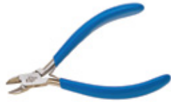
Wire Cutters (or scissors)